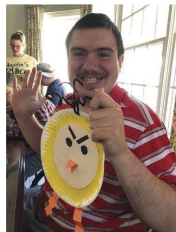
Farm animal fun!!