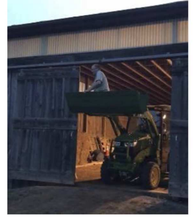
Our VIP going to new heights to help out at Austin's Place!

Taking turns playing corn hole with our friends!