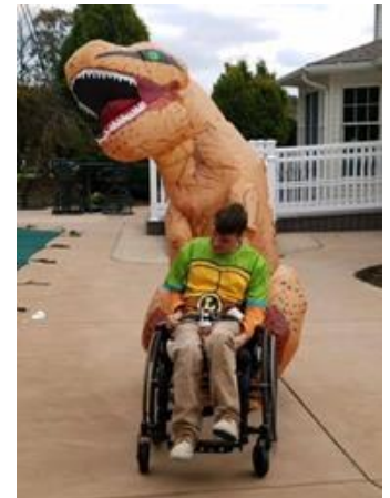
We had a surprise visitor for Halloween this year!