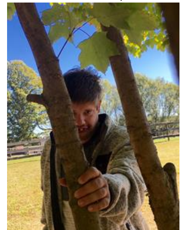
Enjoying the Fall weather!