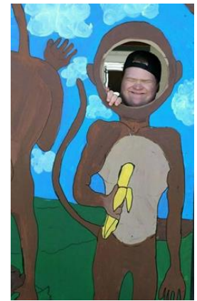
Just monkeying around enjoying the nice weather!