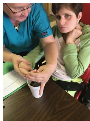
Earth Day cookies and Springtime plants!