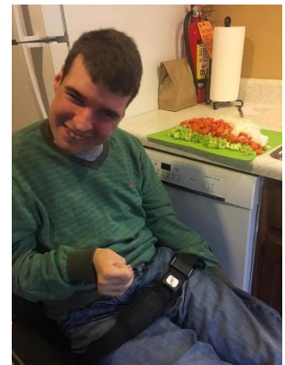
Cutting up veggies for our homemade soup!

So the next time you're in the area, stop by and watch our star worker in action. He'd be happy to say hi and share a drink of water or pop with you!