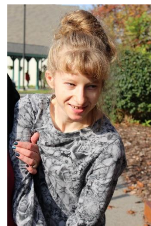
Autumn outside enjoying the Fall air and getting some exercise