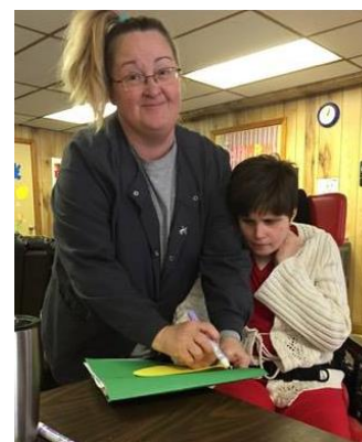
Concentrating to make the perfect door decoration!