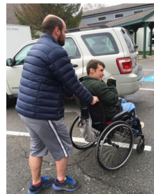
"You've got a friend in me!"

So, the next time you're here at Austin's Place, be sure to let this lovely young lady give you a guided tour of our facilities...but bring your tennis shoes....because you're sure to get a workout.